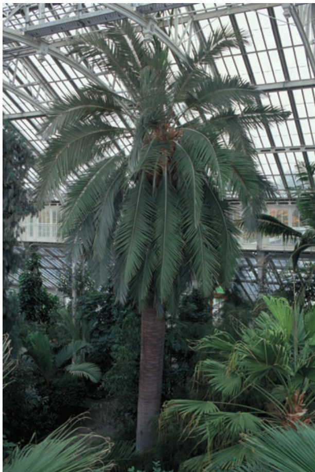
Figure 1. Jubaea chilensis cultivated in the Temperate House at the Royal Botanic Gardens, Kew. The palm, now 163 years old, was raised from seed in 1843. It is said to be the largest and oldest single stemmed palm cultivated under glass outside its natural habitat.

ical generalizations known, respectively, as Cope's "Law" and Corner's "Rules".